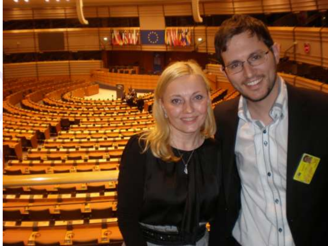
Croatian MP Marijana Petir